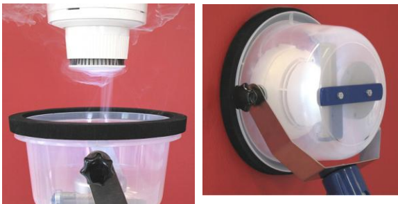
Ceiling Mounted Wall Mounted Detector heads and Aspiration inlets.