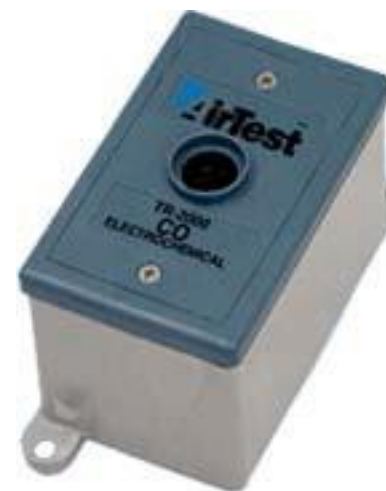
AIR QUALITY SENSOR