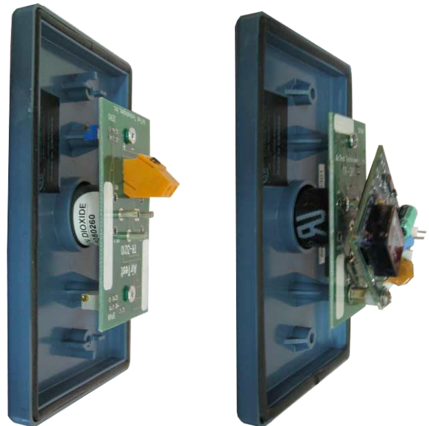
Current Output Version